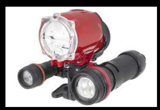
"S-2000" strobe and 2 x LED torches installed on the "Quick Base M6W".