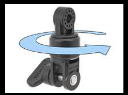
360 degree rotatable body

Attached in between INON "Shoe Base II" and strobe or LED torch to enhance flexibility of lighting thanks to its rotatable body part.