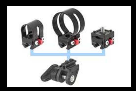
"Quick Base S' can hold one Quick Holder.

Another component part of "Quick Holder System" to attach on YS type arm equipping with male slide socket. Two different types are available; "Quick Base S' carrying one male slide socket or "Quick Base M6W" carrying two of male slide sockets.