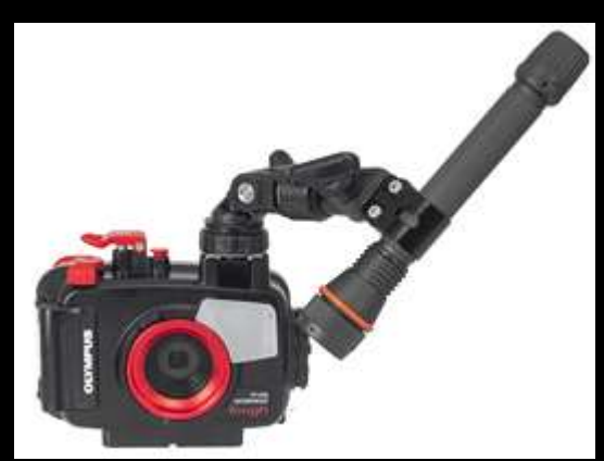
An LED torch installed via "Rotatable YS Extension Bar"