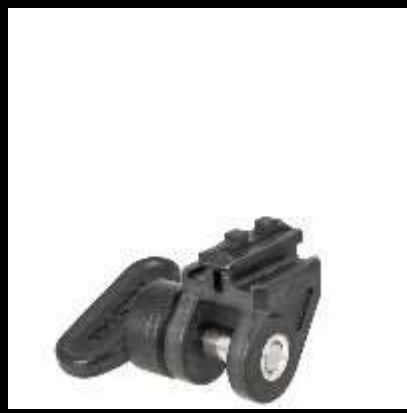
"Quick Base S -Release date: July 14th, 2019 -Retail in Japan: JPY2,000-