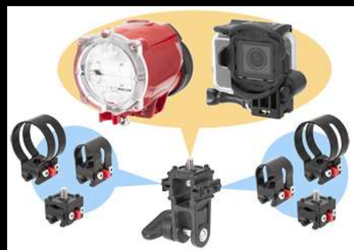
"Quick Base M6W" can hold a strobe or action cam compatible Front Mask product and Quick Holder product(s) at side male slide sockets.